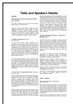
Step 2 - produce content