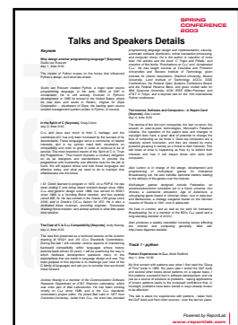
Step 3 - pull them together

To create these illustrations, we used PageCatcher to capture the pages and resize them - zoom in to take a closer look.